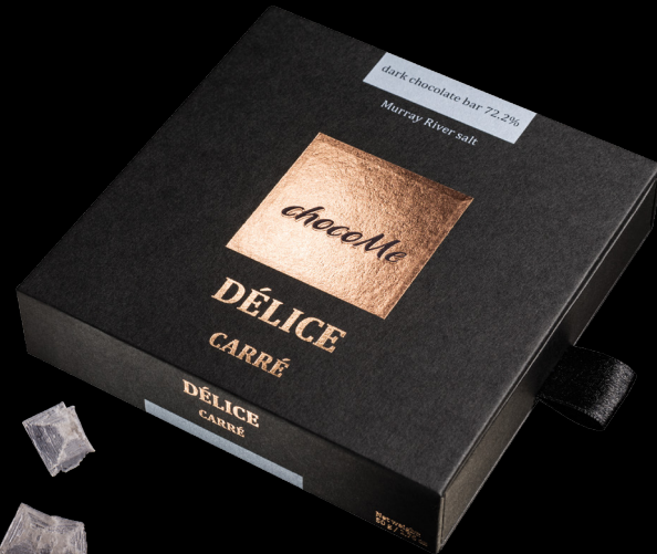
chocoMe Délice Carré 72,2% dark chocolate bar with Murray River salt

The flavour of the chocolate combines a persuasive, yet non-intrusive cocoa character, with dominant tart notes, a strong red fruit undertone, and a lingering aftertaste.