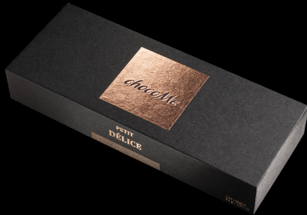
chocoMe Petit Délice 72,2% mini dark chocolate bars

The dragée version of chocoMe's latest, very own dark chocolate recipe for which we use one of the world's finest quality almonds, the Fascionello almond from Avola. Located in the southernmost part of Sicily, this sensational almond put Avola on the world map of gastronomy. Due to the 2600 hours of sunshine, the seaside climate and the calcium-rich soil, the Fascionello almonds have a distinctly flat appearance, with a crunch and taste out of this world. The finished dragées are rolled in cocoa powder from Peruvian cocoa beans hand-picked from the plantation.