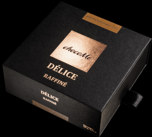
chocoMe Délice Raffiné 72,2% almonds from Avola covered in dark chocolate and cocoa powder

The dragée version of chocoMe's latest, very own dark chocolate recipe for which we use one of the world's finest quality almonds, the Fascionello almond from Avola. Located in the southernmost part of Sicily, this sensational almond put Avola on the world map of gastronomy. Due to the 2600 hours of sunshine, the seaside climate and the calcium-rich soil, the Fascionello almonds have a distinctly flat appearance, with a crunch and taste out of this world. The finished dragées are rolled in cocoa powder from Peruvian cocoa beans hand-picked from the plantation.