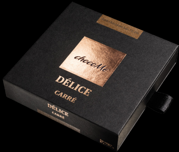
chocoMe Délice Carré 72,2% dark chocolate bar

The flavour of the chocolate combines a persuasive, yet non-intrusive cocoa character, with dominant tart notes, a strong red fruit undertone, and a lingering aftertaste.